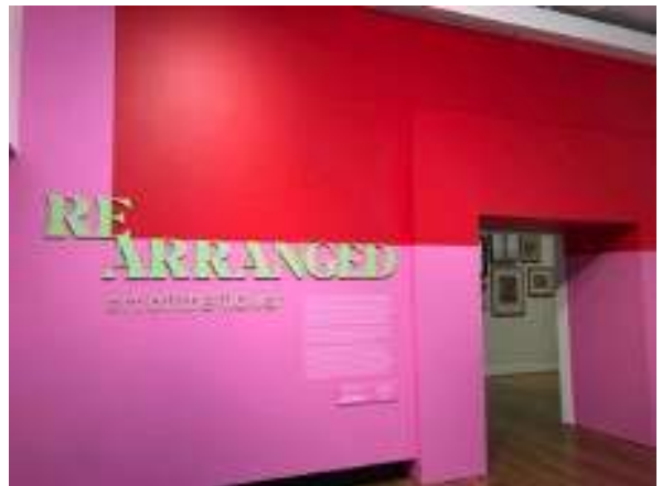
Figure 5, entrance to MoB exhibition, "Rearranged: art of the flower"