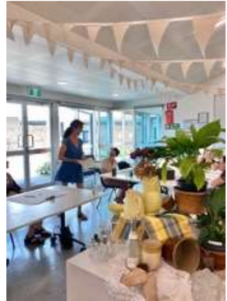
Figure 3 Workshop at Logan Art Gallery

Logan Art Gallery benefitted from the funding through increased attendance - both at the actual exhibition and at the workshops. Each workshop was booked to capacity with a large waiting list and was fully attended. Having the artist (myself) run the workshops allowed gallery staff to work on other matters. Logan Art Gallery also enjoyed additional exposure and exhibition promotion as there was much cross- promotion occurring.