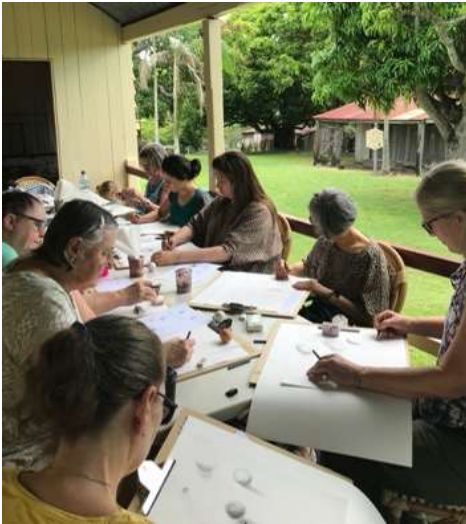
Figure 4 Workshop at Mayes Cottage

In November 2023 I received a $500 bursary from Public Galleries Queensland to deliver an artist talk and two workshops at Logan Art Gallery. The public programming was to support my solo exhibition Remnants of the Past which showed from the 1 st December 2023 – 20 th January 2024.