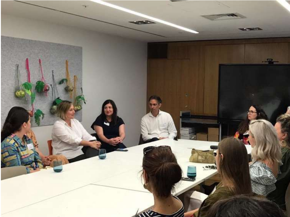
Figure 7 Gallery directors at the PGQ Directors Forum, MoB, Dec 2023